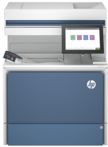
HP Color LaserJet Enterprise MFP 6800dn Printer

This printer is intended to work only with cartridges that have a new or reused HP chip, and it uses dynamic security measures to block cartridges using a non-HP chip. Periodic firmware updates will maintain the effectiveness of these measures and block cartridges that previously worked. A reused HP chip enables the use of reused, remanufactured, and refilled cartridges. More at: http://www.hp.com/learn/ds