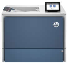
HP Color LaserJet Enterprise 5700dn Printer

This printer is intended to work only with cartridges that have a new or reused HP chip, and it uses dynamic security measures to block cartridges using a non-HP chip. Periodic firmware updates will maintain the effectiveness of these measures and block cartridges that previously worked. A reused HP chip enables the use of reused, remanufactured, and refilled cartridges. More at: http://www.hp.com/learn/ds